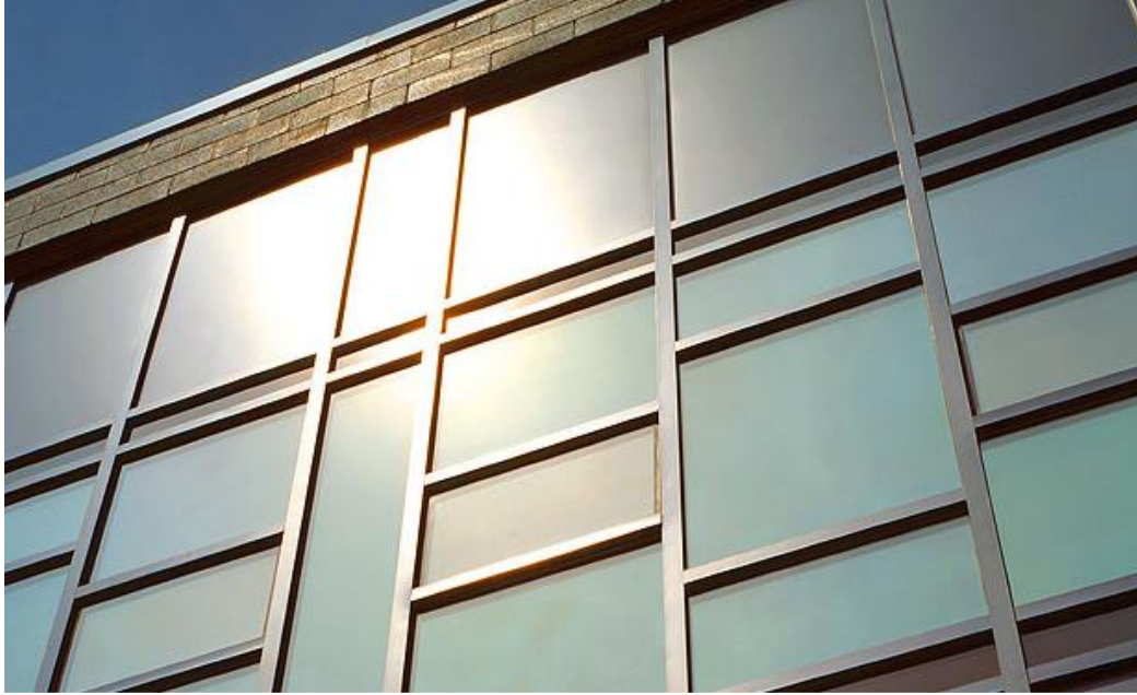
EFCO Series 403

This Environmental Product Declaration (EPD) was prepared in accordance with ISO 14025 and 21930 using the Earthsure Cradle to Gate Window Product Category Rule 30171600-2015. EPDs are not intended to make comparisons with other products due to varying background data in LCA softwares and/or varying program operator rules or Product Category Rules. An EPD is informational and does not warrant performance. Valid 22 May 2017 through 21 May 2022.